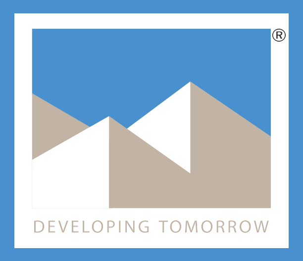
Neo Infracon Limited Annual Report 2022-23